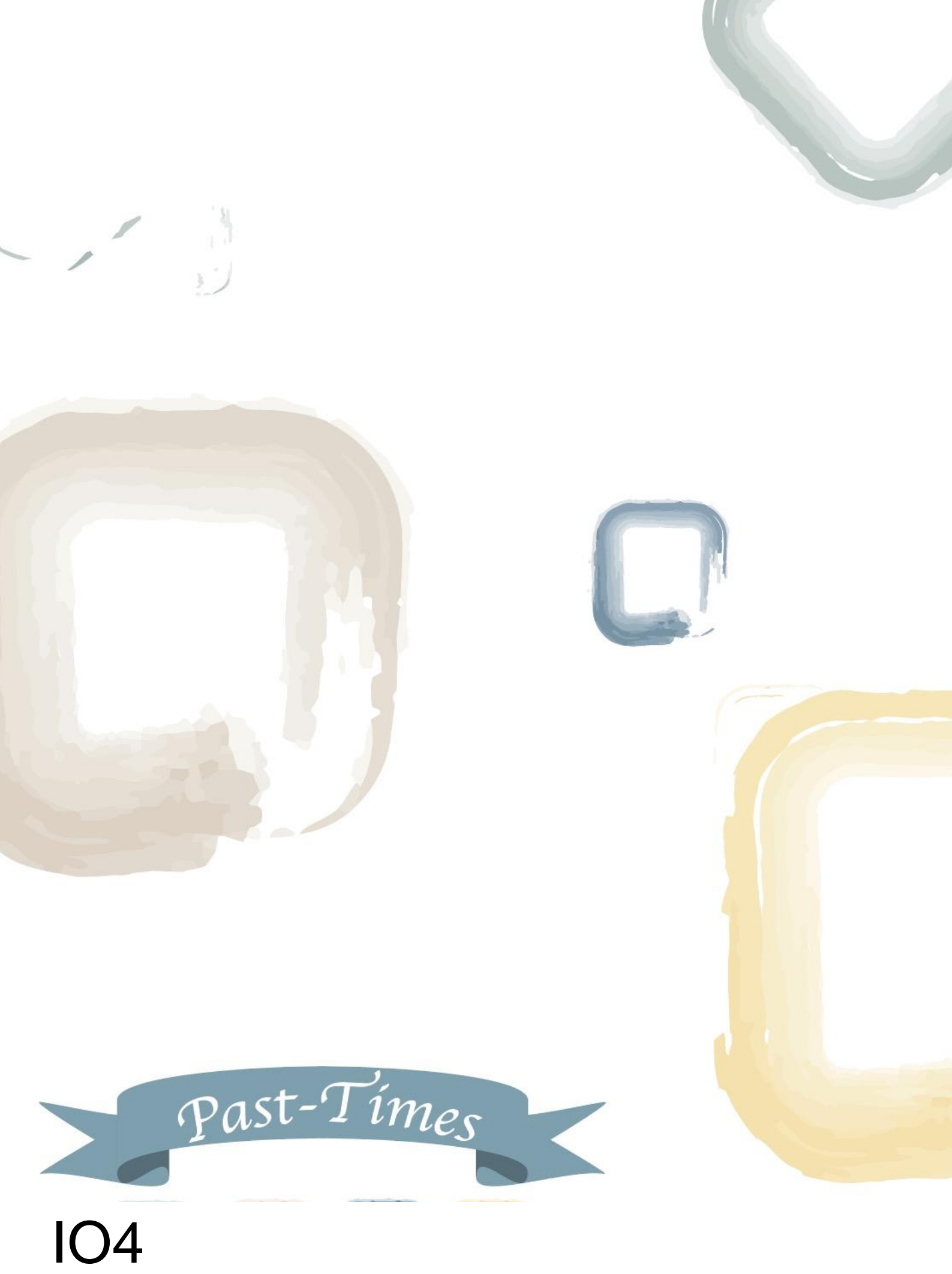
IO4 Webquest History